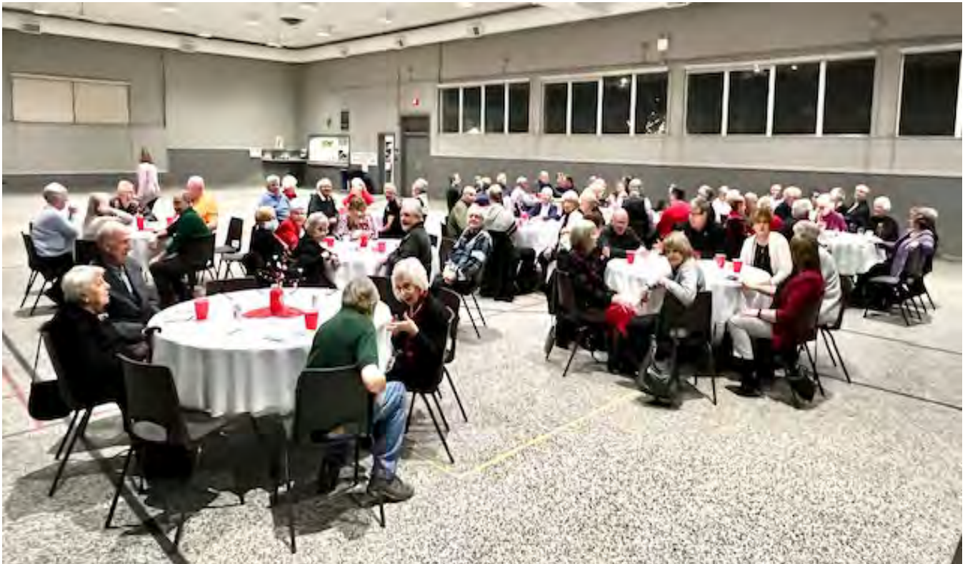
Ladies Night 2024