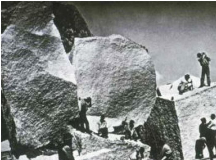
Granite blocks being prepared to haul to the Salt Lake Temple site.

Continued from page 1 be his only contribution. Within three years he was working on the construction of the Salt Lake Temple