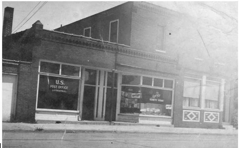
1930s. Post office on left of building, Reeves Variety Store and the Livingston Bank,