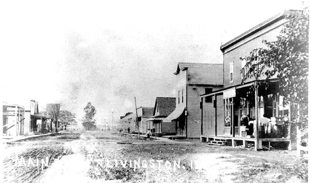
Below, Livingston Avenue as seen some forty years later. At far right is the Skamenca Building (currently Bob's Auto Service), then the Schwartz Hotel (now Kirkwood's Bar and Grill). The furthest building is the site of Gasperoni's Italian Store. You can see the old water tower in the background.