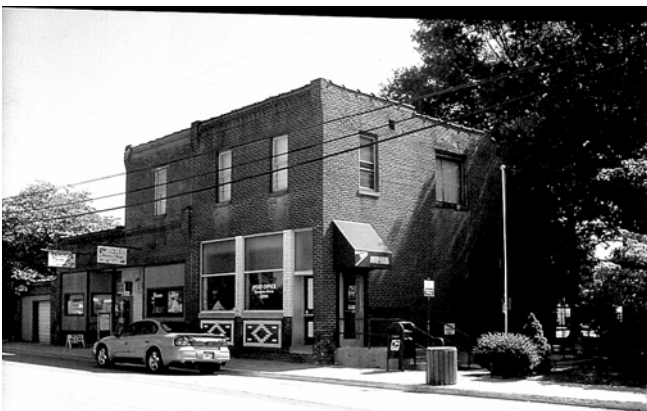
Site of the current Post Office.