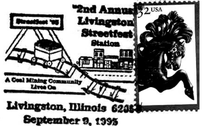
Livingston Special Edition Postmark. September 9, 1995 Sponsored by Livingston Streetfest Committee