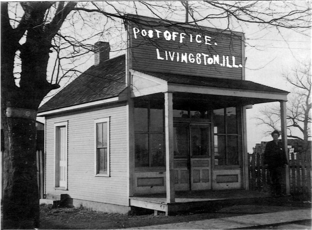
The first U.S. Post Office in Livingston was located in the Livingston Lumber Company office. The lettering on the building was actually scratched into the negative of this photo and did not appear on the building.