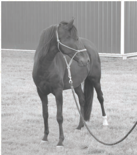
AST Magia de la Noche RTP Casino x PJP Buena Suerte