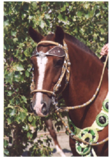
RJT Colorado Real++