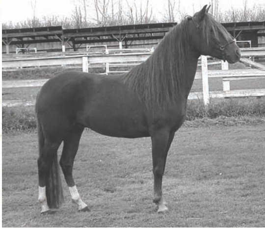
PJP Sol Saliente PJP Diamante del Norte x Rareza DL