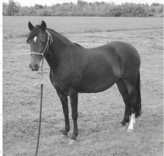
PJP Buena Suerte *MSP Condestable x Aranuella CM