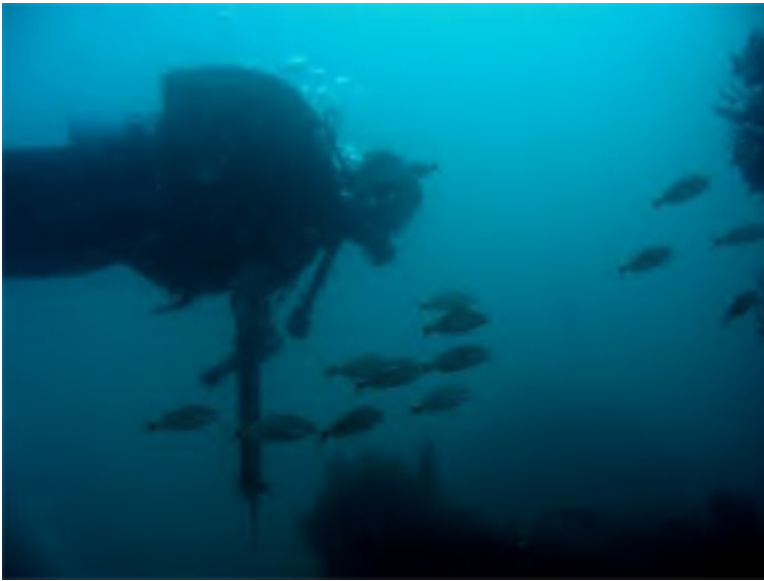
“Diver on South Carolina wreck”