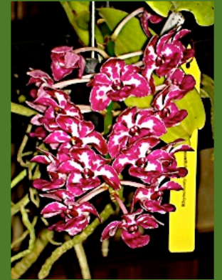
Rhy. gigantea 'Spot' Grown by R. Ference