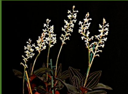
Ludisia discolor Grown by G&H Zona