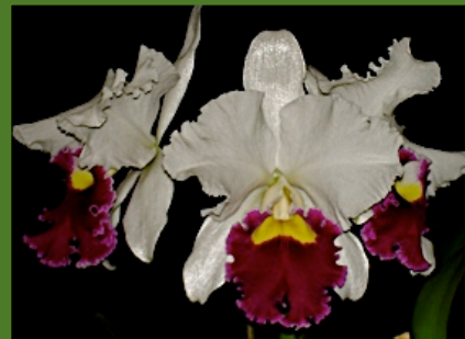
Lc. Orlades Grand 'Yu Chan Beauty' Grown by R. Ference