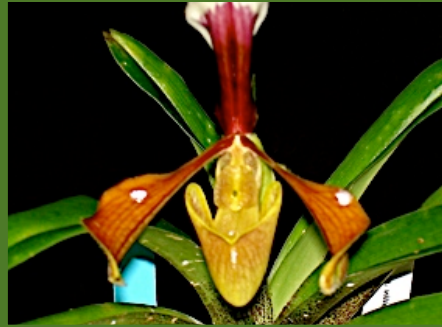
Paph. villosum Grown by M. Penso