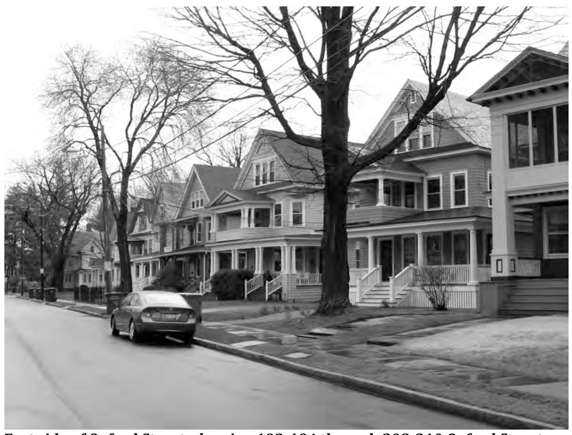
East side of Oxford Street, showing 192-194 through 208-210 Oxford Street. Camera facing northeast. Photograph 2 of 30