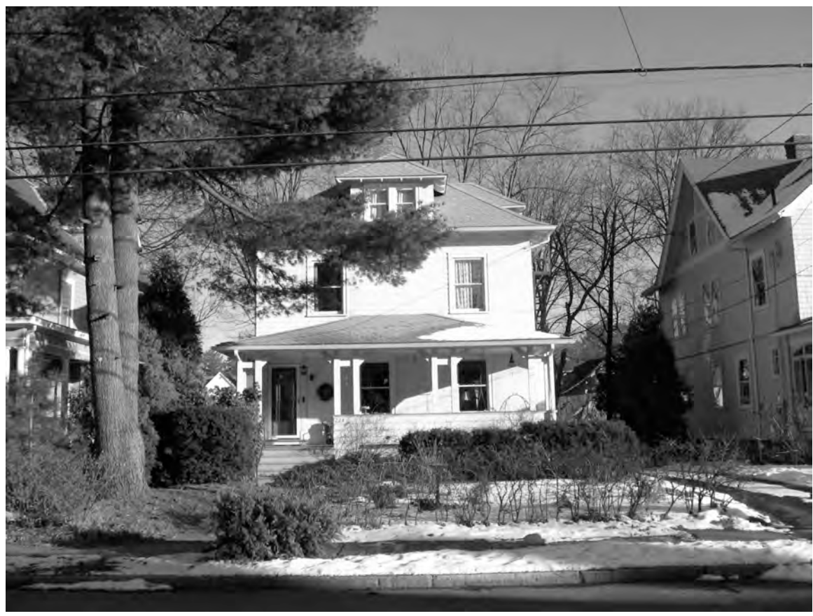
West (front) elevation of 224 Oxford Street, showing façade, roof, and porch details.