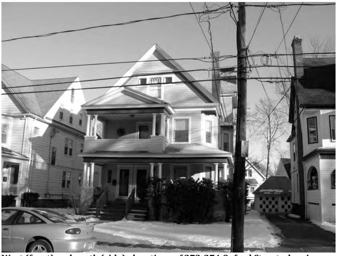
West (front) and south (side) elevations of 272-274 Oxford Street, showing façade, porch, and window details. Camera facing east.