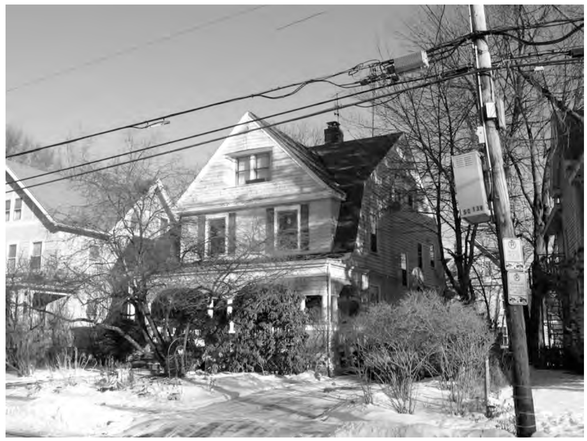
West (front) and south (side) elevations of 216 Oxford Street, showing façade, porch, and window details. Camera facing northeast. Photograph 14 of 30