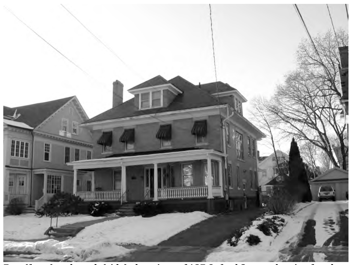
East (front) and north (side) elevations of 187 Oxford Street, showing façade, roof, and porch details. Camera facing southwest. Photograph 23 of 30