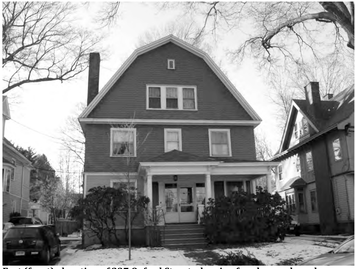
East (front) elevation of 237 Oxford Street, showing façade, porch, and window details. Camera facing west. Photograph 15 of 30