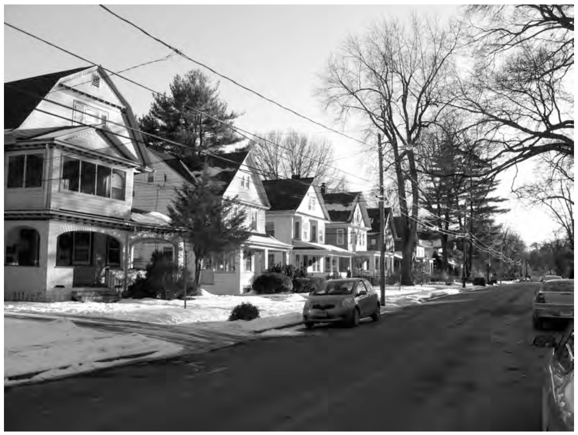
East side of Oxford Street, showing 244-246 through 228 Oxford Street. Camera facing southeast. Photograph 1 of 30