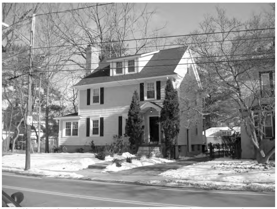
West (front) and south (side) elevations of 208-210 Whitney Street, showing façade, porch, and window details.