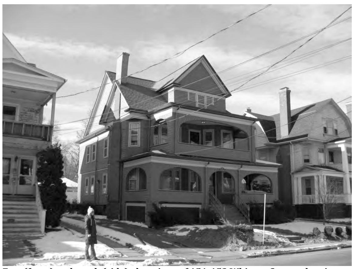
East (front) and south (side) elevations of 151-153 Whitney Street, showing façade, porch, and window details. Camera facing northwest. Photograph 7 of 30