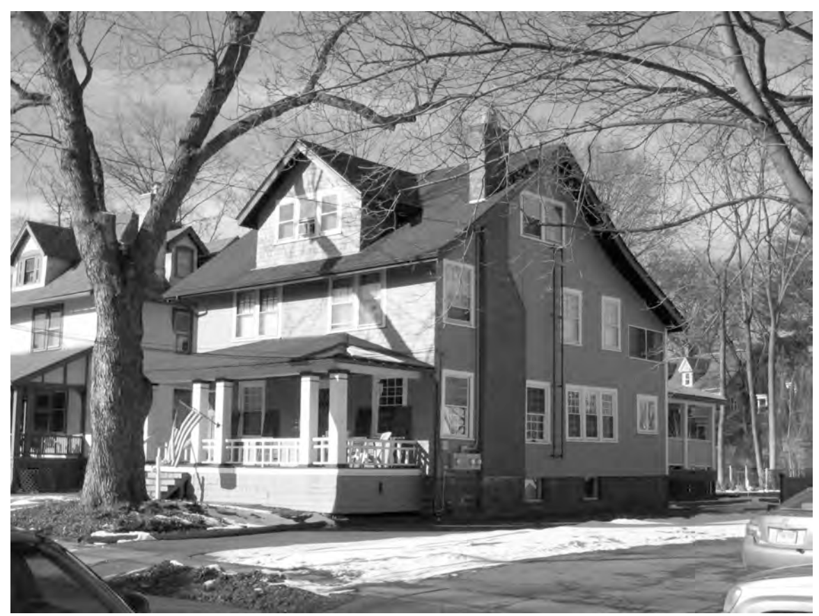
South (front) and east (side) elevations of 82 Fern Street, showing façade, roof, and porch details. Camera facing northwest.