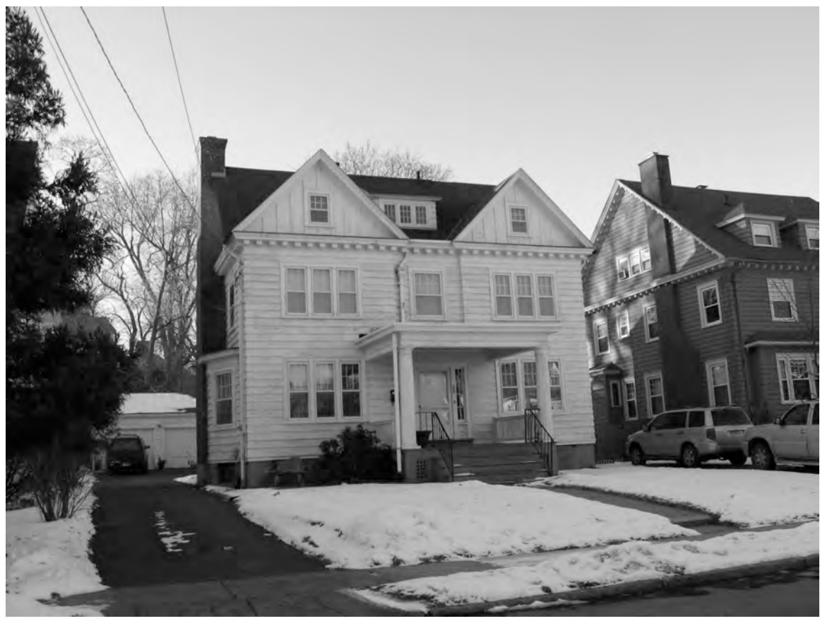
East (front) elevation of 283 Oxford Street, showing façade, gable, and porch details. Camera facing northwest. Photograph 19 of 30