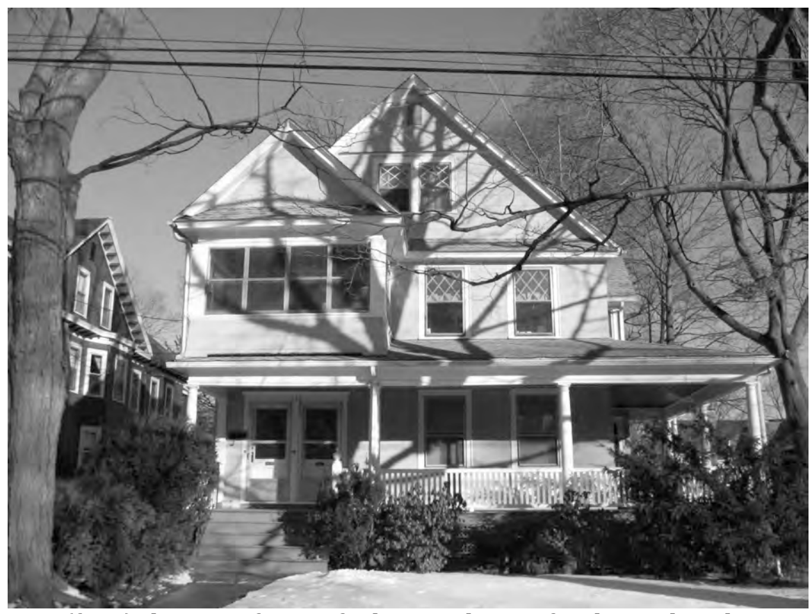
West (front) elevation of 182 Oxford Street, showing façade, porch, and window details. Camera facing east. Photograph 5 of 30