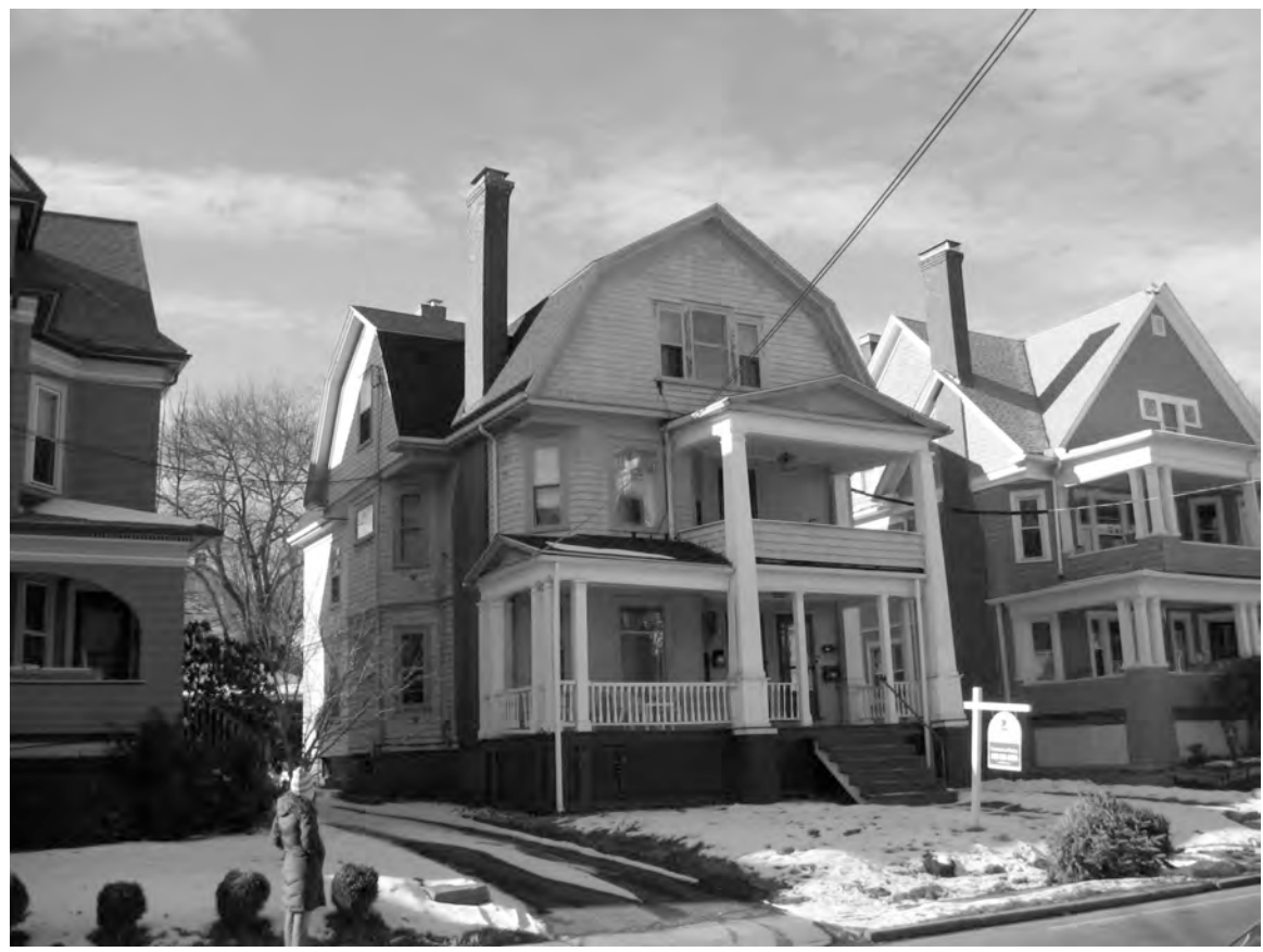
East (front) and south (side) elevations of 155-157 Whitney Street, showing façade, porch, and window details. Camera facing northwest. Photograph 13 of 30