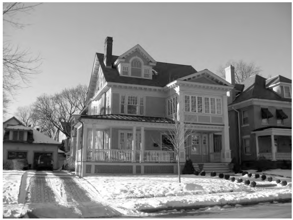
East (front) and south (side) elevations of 183-185 Oxford Street, showing façade, porch, and window details. Camera facing northwest. Photograph 16 of 30