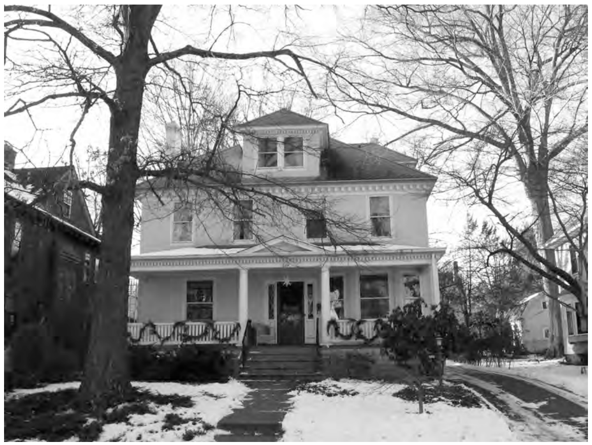
East (front) elevation of 229 Oxford Street, showing façade, roof, and porch details.