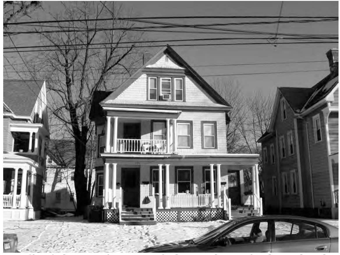
West (front) elevation of 204-206 Oxford Street, showing façade, porch, and window details. Camera facing east. Photograph 10 of 30