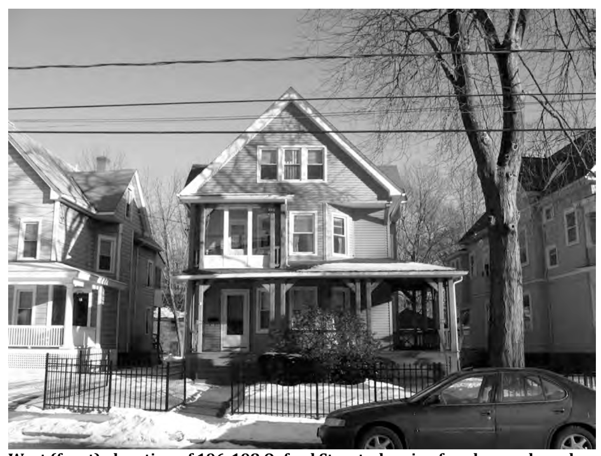
West (front) elevation of 196-198 Oxford Street, showing façade, porch, and window details. Camera facing east. Photograph 6 of 30