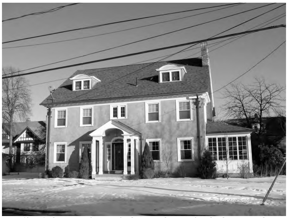
West (front) elevation of 300 Oxford Street, showing façade, dormer, and portico details. Camera facing east. Photograph 21 of 30