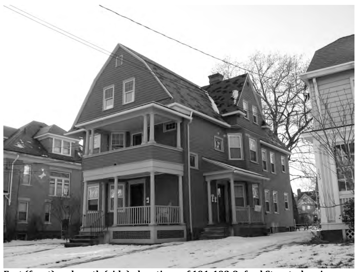
East (front) and north (side) elevations of 191-193 Oxford Street, showing façade, porch, and window details. Camera facing southwest. Photograph 8 of 30