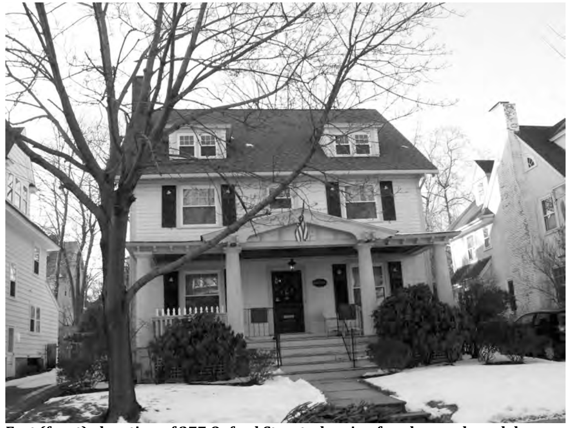
East (front) elevation of 277 Oxford Street, showing façade, porch, and dormer details.