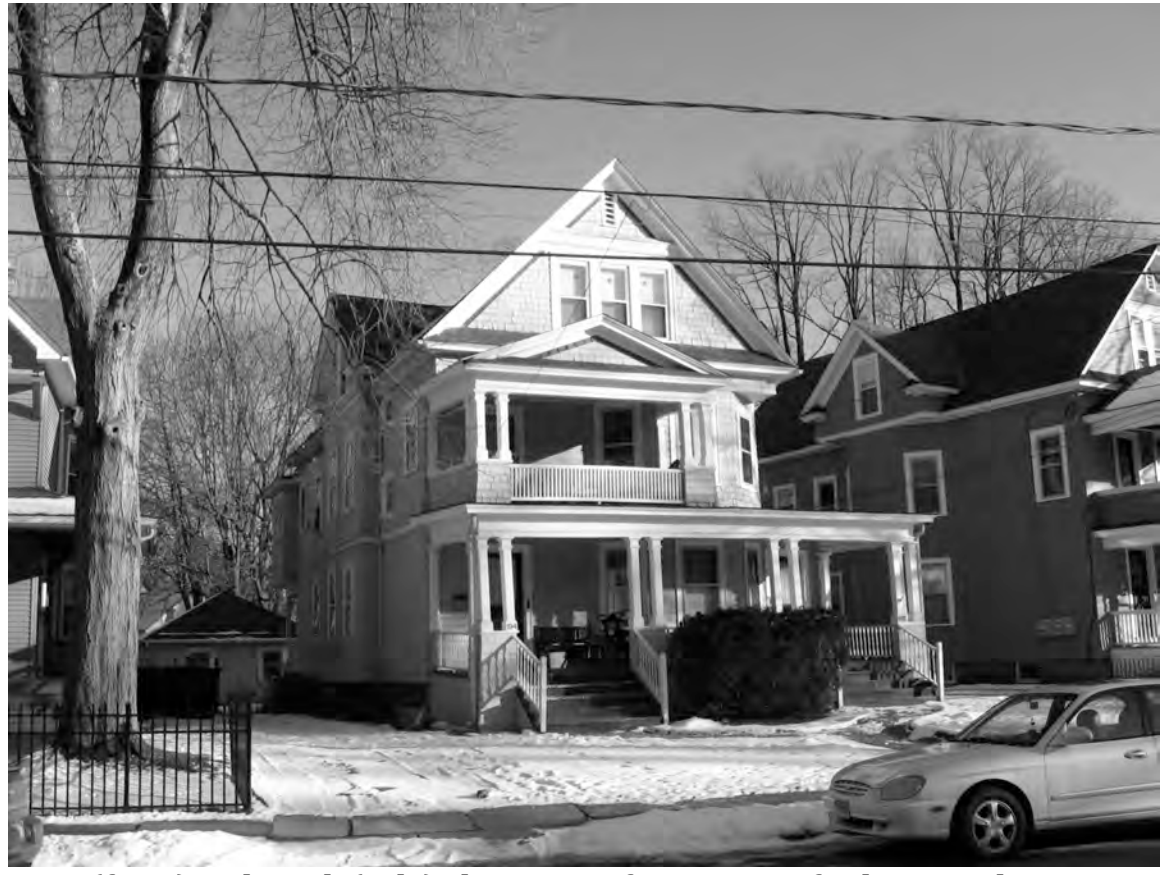
West (front) and north (side) elevations of 192-194 Oxford Street, showing façade, porch, and window details. Camera facing southeast. Photograph 11 of 30