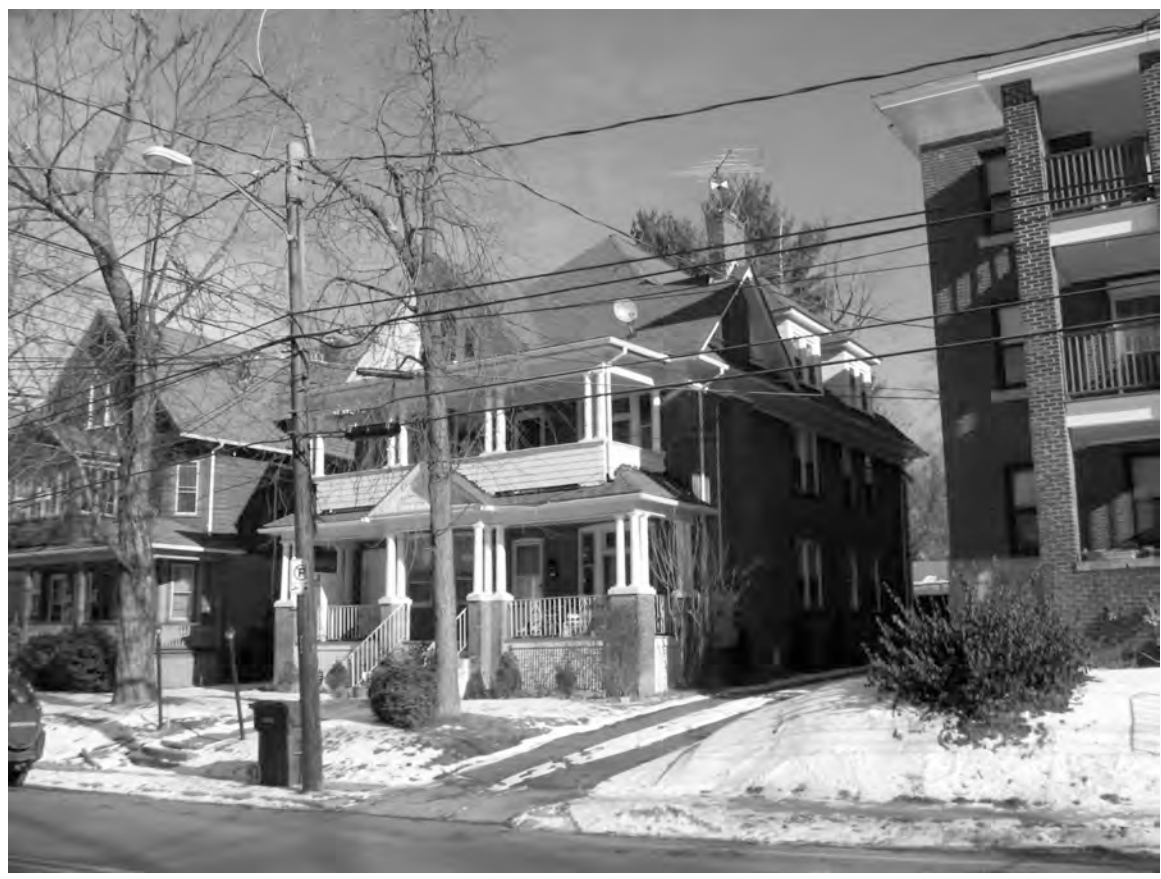
West (front) and south (side) elevations of 150-152 Whitney Street, showing façade, roof, porch, and window details. Camera facing northeast. Photograph 4 of 30