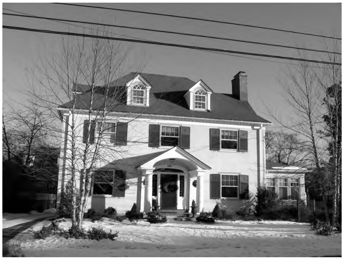
West (front) elevation of 296 Oxford Street, showing façade, roof, and dormer details.