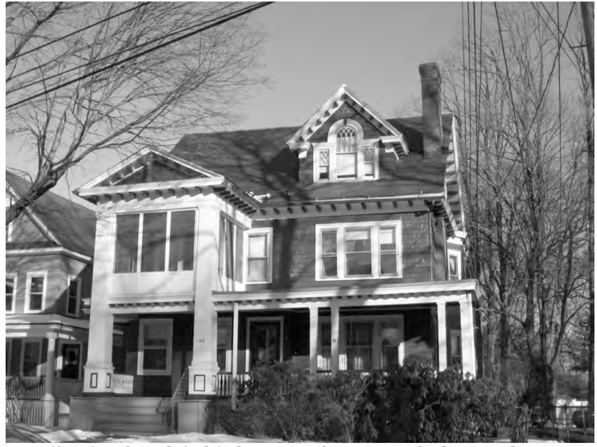
West (front) and south (side) elevations of 184-186 Oxford Street, showing façade, porch, and window details. Camera facing northeast. Photograph 17 of 30