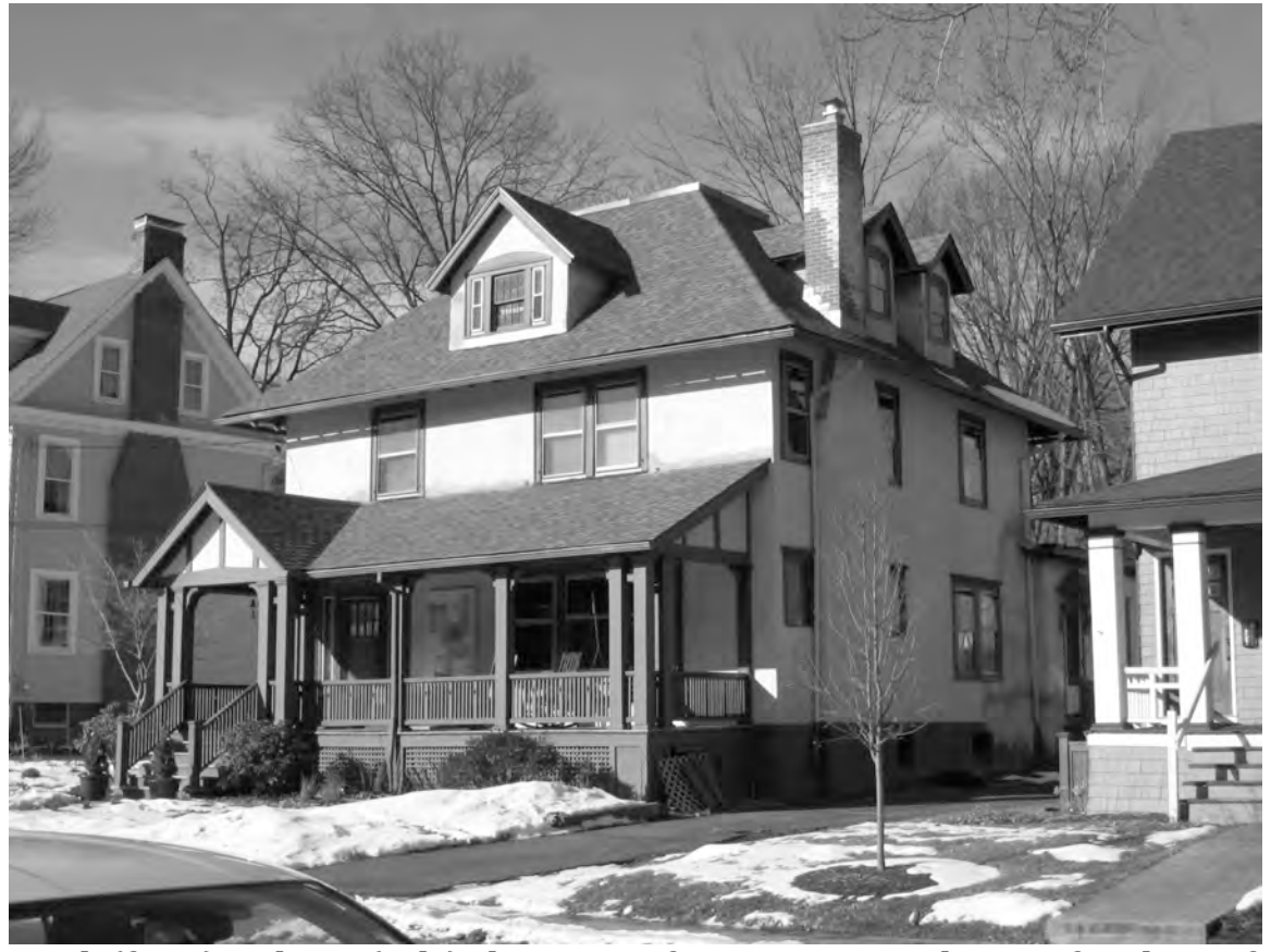
South (front) and east (side) elevations of 88 Fern Street, showing façade, roof, and porch details.