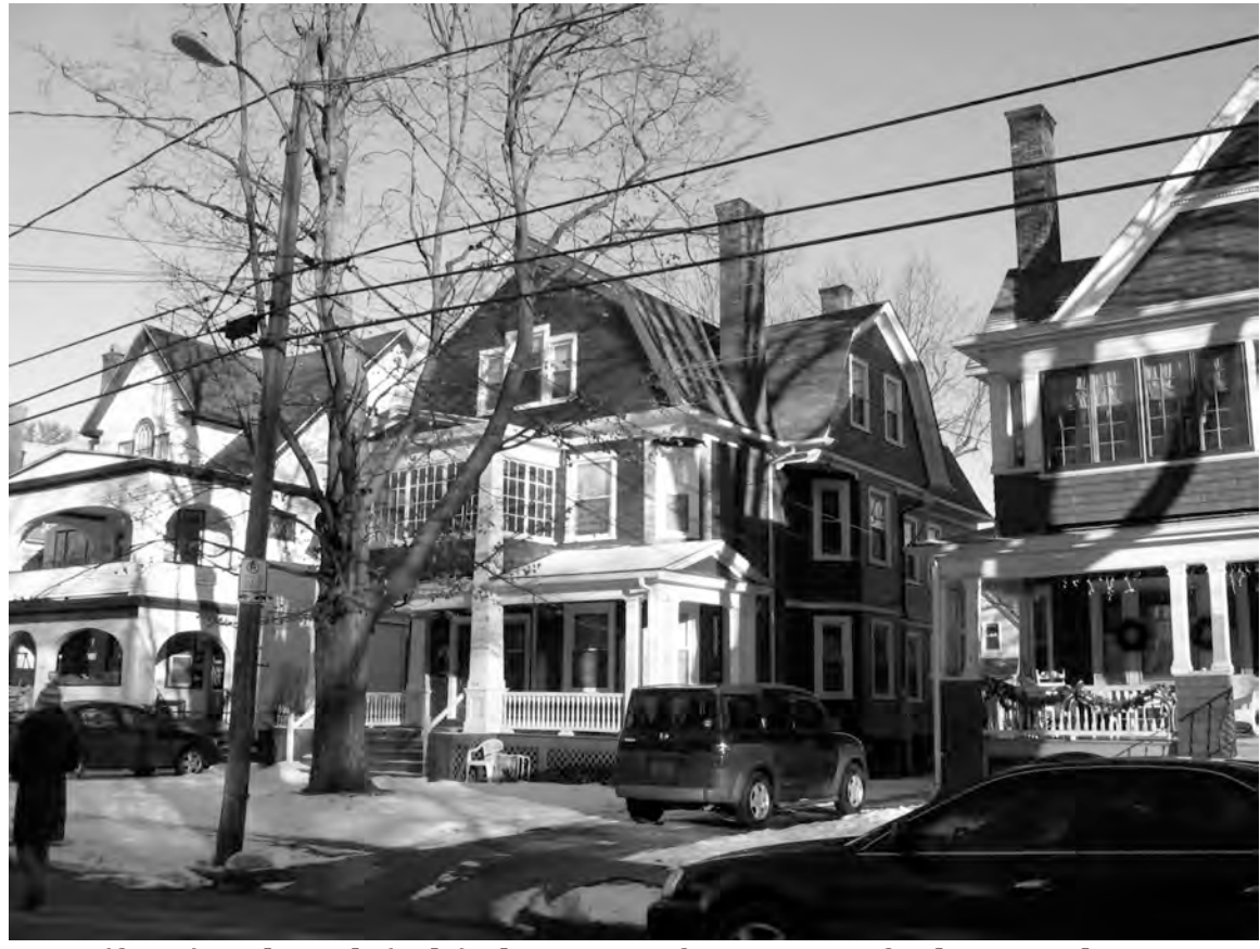
West (front) and south (side) elevations of 264-266 Oxford Street, showing façade, porch, and window details. Camera facing northeast. Photograph 12 of 30