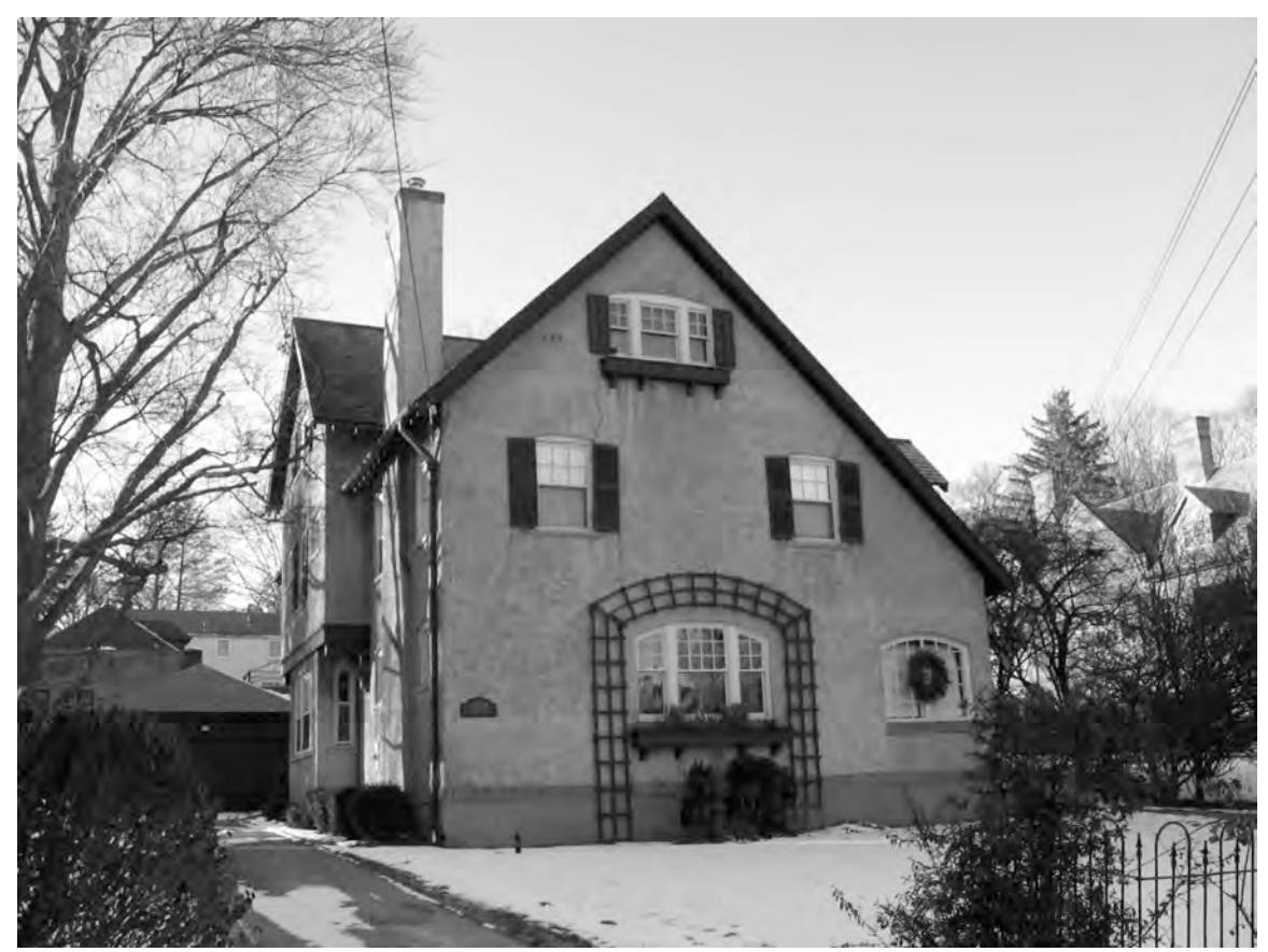
East (front) and south (side) elevations of 293 Oxford Street, showing façade, gable, and window details. Camera facing northwest. Photograph 30 of 30