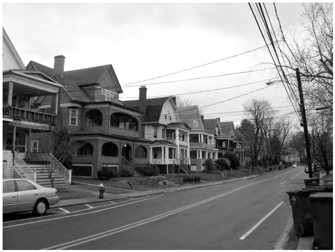
West side of Whitney Street, showing 151-153 through 183-185 Whitney Street. Camera facing northwest. Photograph 3 of 30