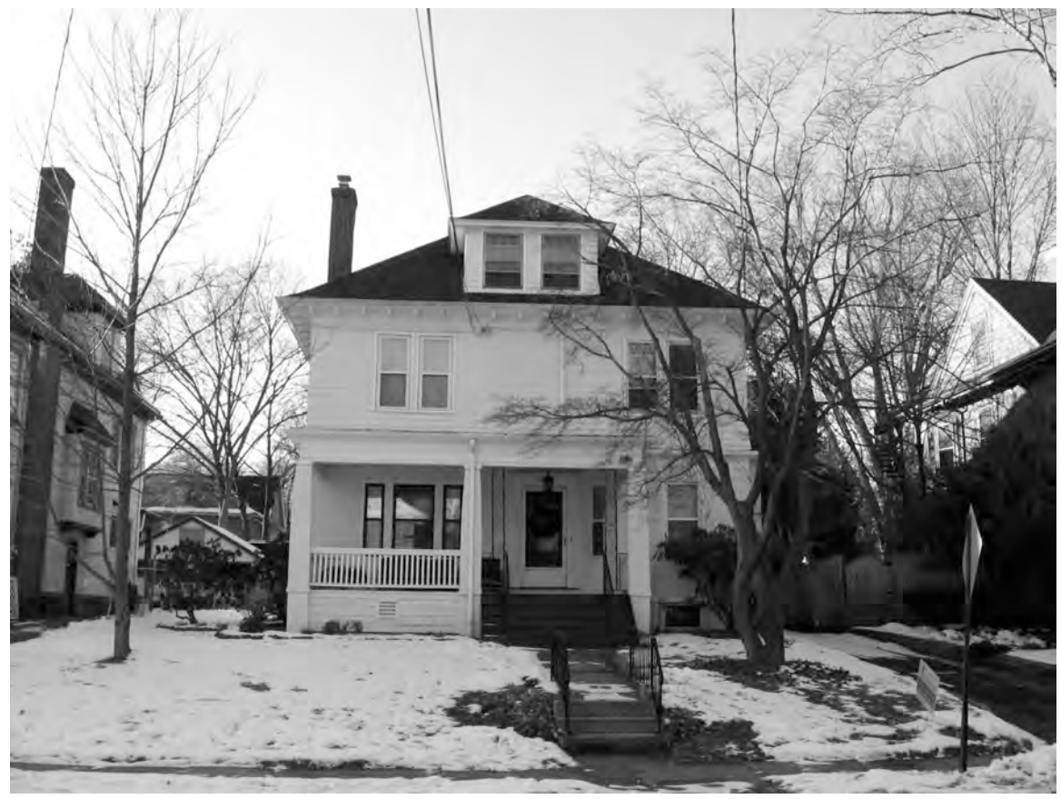
East (front) elevation of 223 Oxford Street, showing façade, porch, and window details. Camera facing west. Photograph 25 of 30