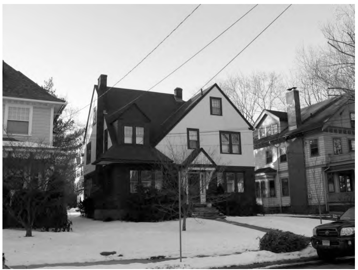
East (front) and south (side) elevations of 253 Oxford Street, showing façade, gable, and entry porch details. Camera facing northwest. Photograph 29 of 30