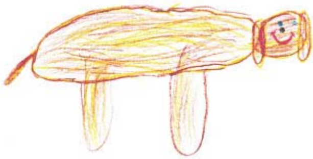
Megan, age 4

If you work in an office with lots of people, chances are that you work with a person who hangs pictures up that their kids have drawn. The pictures are always of some stupid flower or a tree with wheels. These pictures suck; I could draw pictures much better. In fact, I can spell, do math and run faster than your kids. So being that my skills are obviously superior to those of children, I've taken the liberty to judge art work done by other kids on the internet. I'll be assigning a grade A through F for each piece: