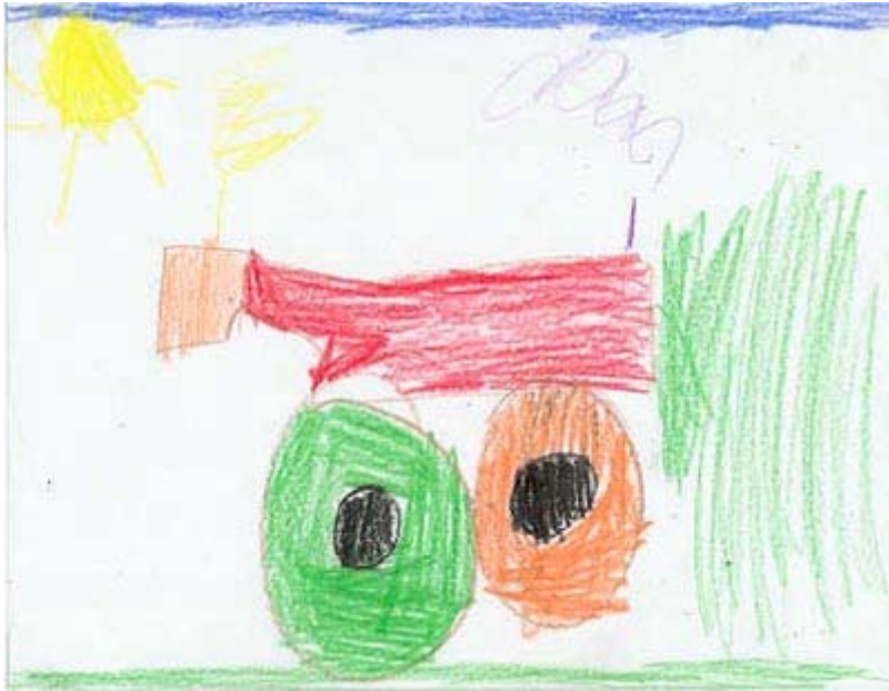
Seth, age 4

Vrrrrroooooooooooooooooommmmmmm! Grade: F