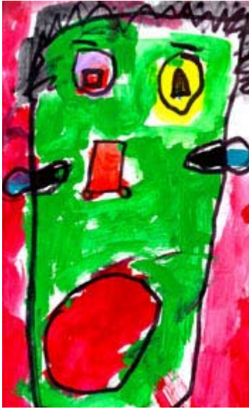
Bryce, age 10

This one wouldn't be too bad if the color was kept inside the lines, you picked a new perspective, used non-abrasive colors and asked someone with talent to paint it for you On one hand I want to give an A for effort but... F