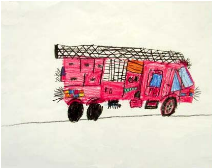
Jon, age 8

This one wouldn't be too bad if the color was kept inside the lines, you picked a new perspective, used non-abrasive colors and asked someone with talent to paint it for you On one hand I want to give an A for effort but... F