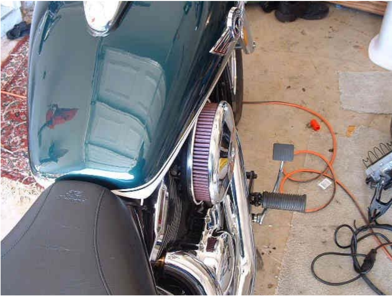
Rear top view of finished product of Scooterizing