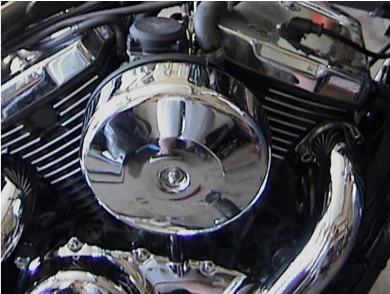
Top side view of finished product of Grampsizing Note “stock” look, but snorkel missing This process provides the same airflow and horsepower boost as Scooterizing; just a different final look