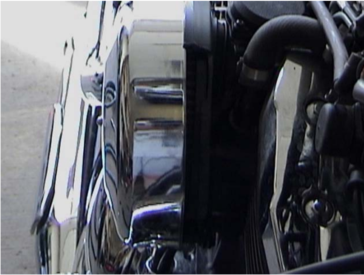
Front view of final product of Grampsizing