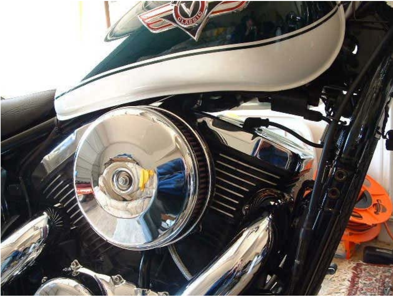
Side view of finished product of Scooterizing