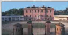
Tryon Palace Historic Sites & Gardens

Pepper's Passion... The Birthplace Of Pepsi-Cola