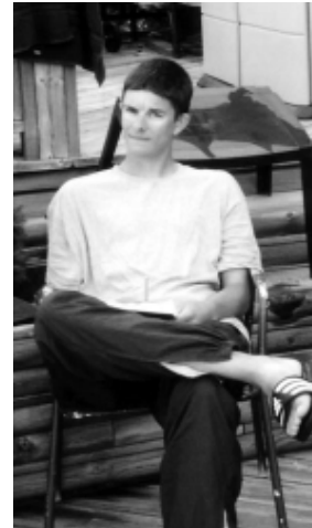
*Shake* all shook up