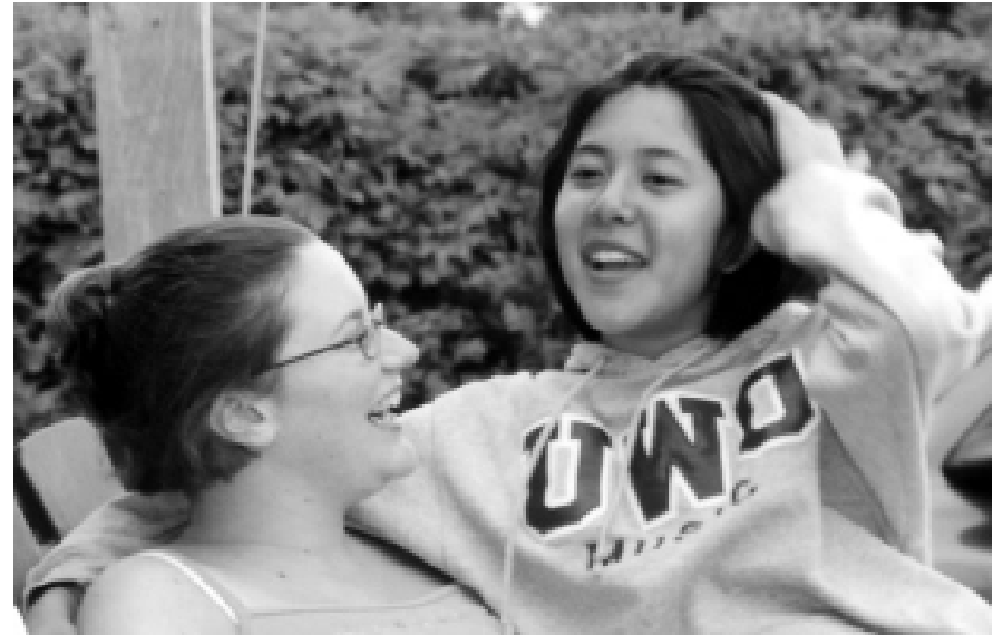
Quaster Biefly and Ichabod share a "moment"

Friday - GO TO CLASSES!! Academic café in the evening followed by the COFFEE HOUSE! This is one of my favourite events because it's basically open mic night.