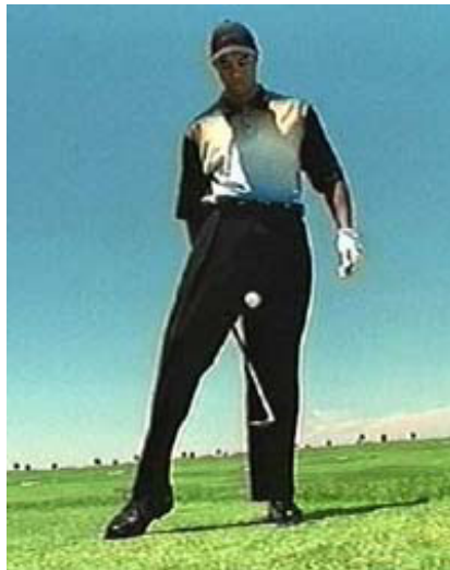
Our use of this photo is nothing less than shameless