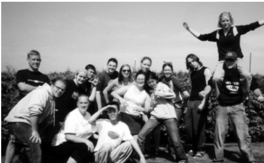
the 2003 Soph team