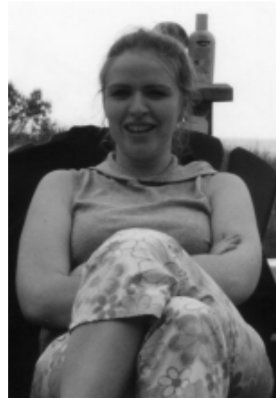
The arms of The Arm