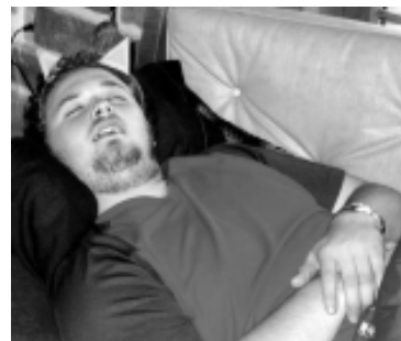
Soph Tank Tanks up

ORIENTATION WEEK: OK, so I'm sure you know what it is by now, but just to reiterate, it's the week before school where you're bombarded by people and places and events and parties and all this other stuff that's so