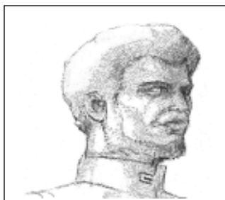
Zeon Zum Deikun, founder of the first independent space nation.

The original democratic government of Side 3. The Republic is established in U.C. 0058 under the leadership of Zeon Zum