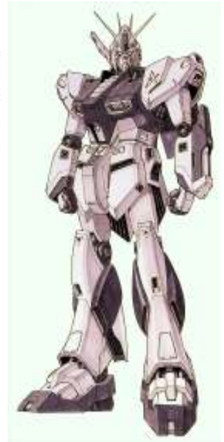
MS: Mark II