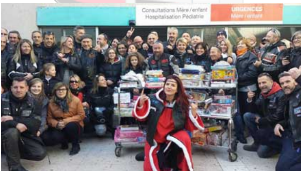
1 cart loaded with gifts, little break to capture the événement and forward to the pediatric ward with a few volunteers for distribution