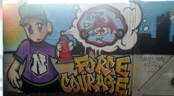
The regional press has once again welcomed the efforts of our brothers and supported by a multitude of different clubs and biker unlabeled.