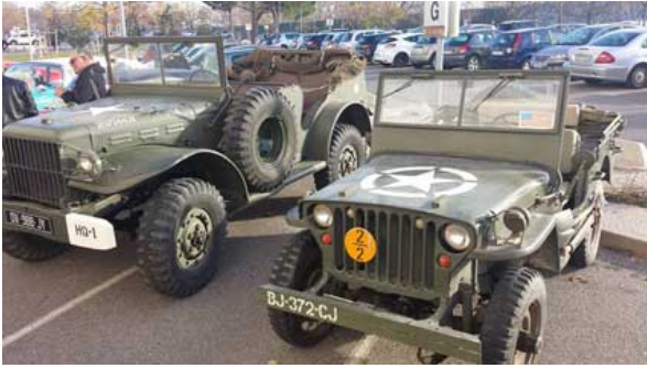
US vehicles collection close the convoy of some 70 motorbikes of all brands.