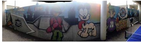
This year, in parallel, volunteers graffiti artists came decide their talent, for delimiting the panels rest area teenagers, paint bombs being offered by Chapter # 157.