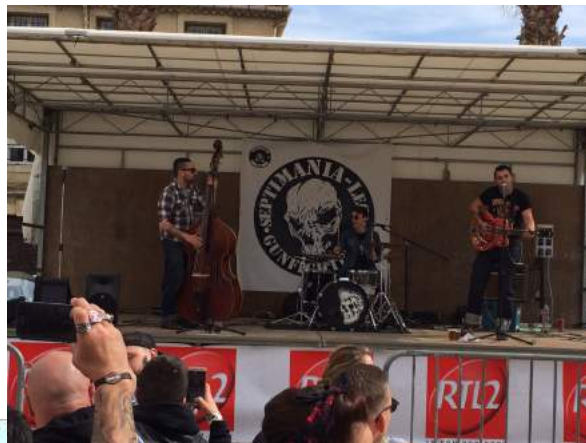
As the barber of the corner ...