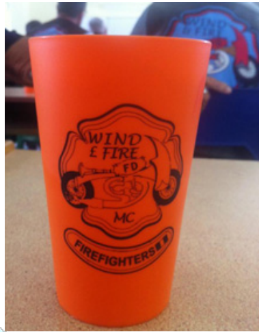
The highly anticipated rebate colors