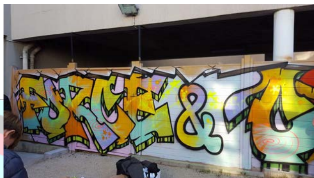
"STRENGTH AND COURAGE"

Little glimpse at the passage of the evolution of the drawing started early in the morning by our volunteer Graffiti artists to whom we had bought the paintings,