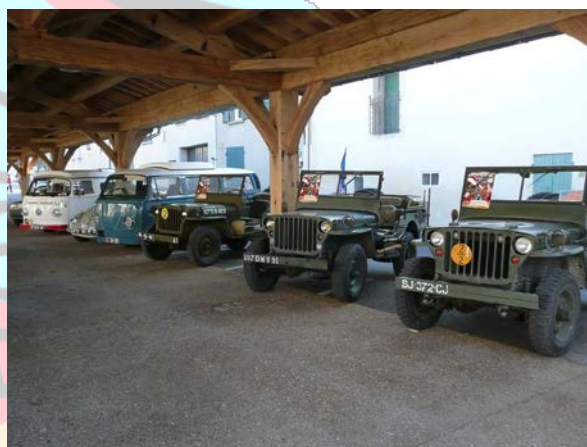
Photo with our friends