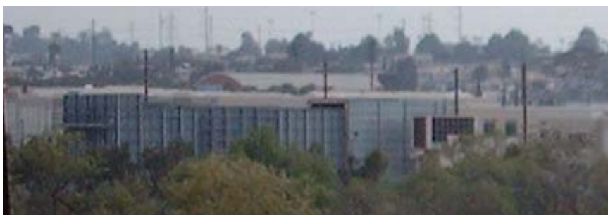
A view from Beyer Way further north than above.

http://www.youtube.com/watch?v=3kyhMuXN9Mg&feature=related