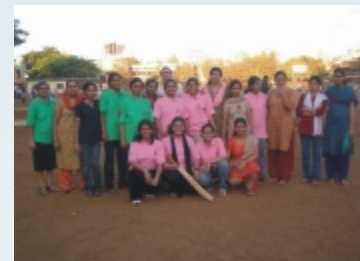
Participants for the Ladies Match