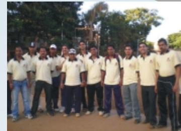
The victorious "Marketing & Support Functions Team"

A big thank you to all the players and supporters for making this event an unforgettable experience.