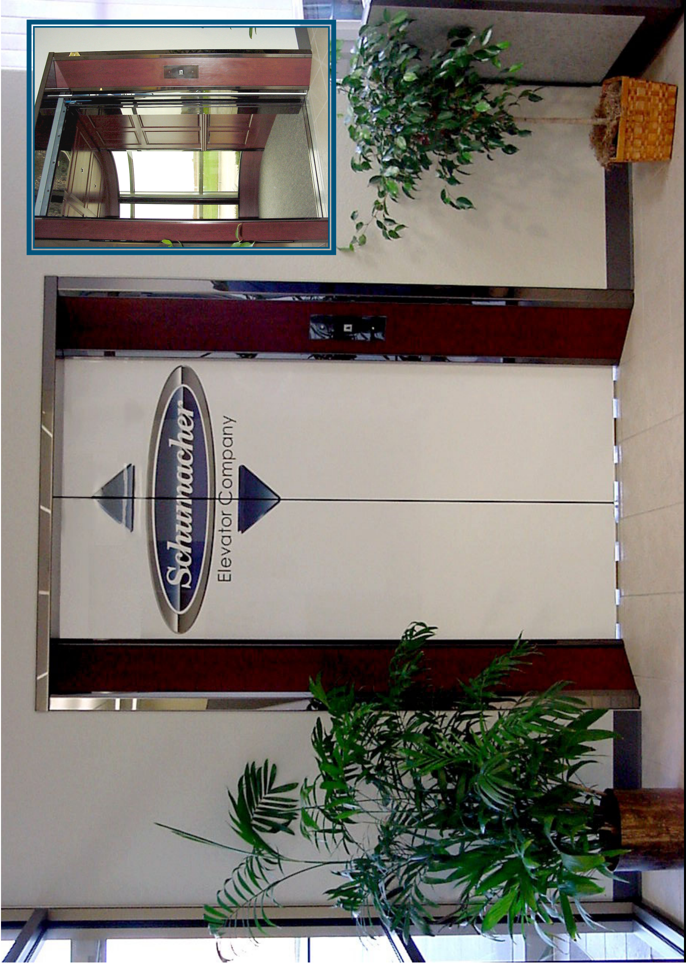
An excellent example of the custom work we do can be seen in the front entrance of our office.