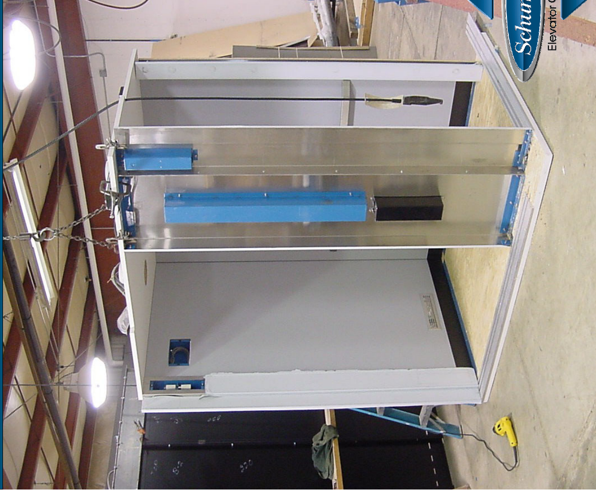
(Right) Custom Wood Cab with Stone Tile Inlay (Below) LU/LA Front & Side Open Cab