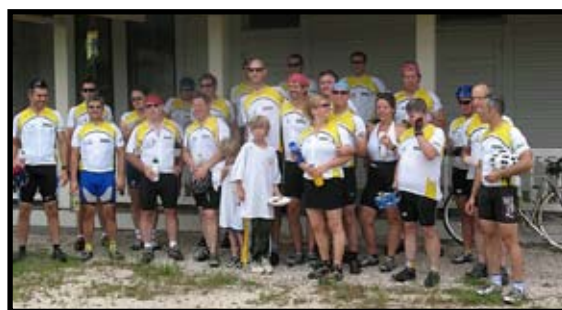
Cyclists lunch at Manda

KTBC Fox 7 Pro Cycle Works Texas Gas Service Red Holdings Carino's Italian Grill