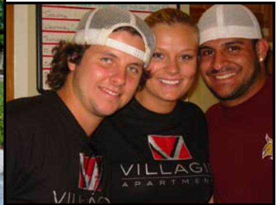
Villagio Apartment Volunteers