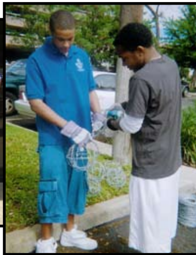
Jack & Jill Volunteers