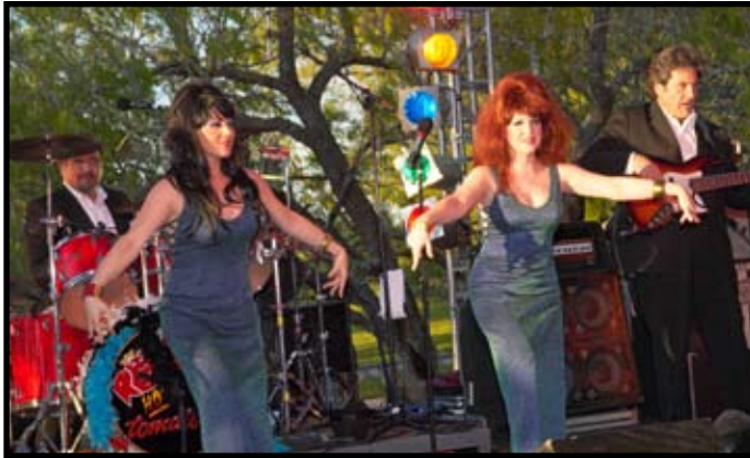
Rotel and the Hot Tomatoes