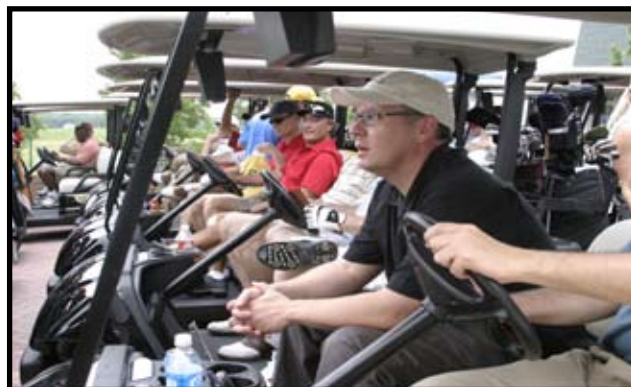
Golfers get ready!

The 2007 KASE Country Classic and Amateur hosted at ShadowGlen, April 21-23, raised the bar for Texas golfing. Raising over $50,000 toward construction of the new House, the golf tournament included live country music on the course, country music trivia games, Ronald McDonald, delicious food by Fuddruckers and Matt's El Rancho, and ice cream treats by Texas favorite Blue Bell. A special thanks to the entire ShadowGlen and KASE 101 teams. Your support helps us reach beyond Austin into the communities we serve.