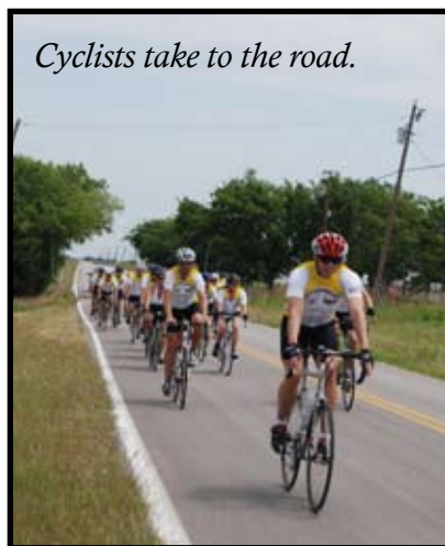
Cyclists take to the road.