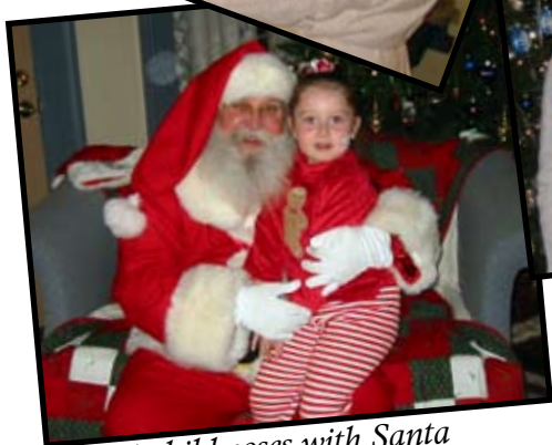
A child poses with Santa