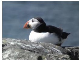
Puffin on the Isle of May in may (while at Lundin Links)