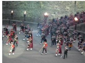
We did the Edinburgh tattoo in August— first time in years!