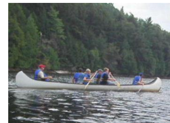
Canoeing at Halliburton forest