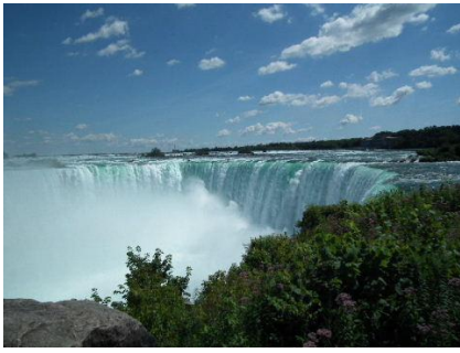
This is the view of Niagara Falls taken on our trip to Canada in August