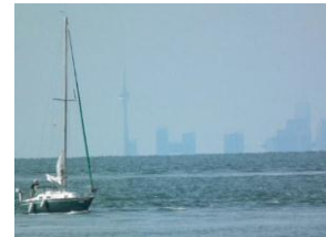
View of Toronto CN tower from Niagara on the Lake