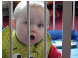
Murray in baby jail!