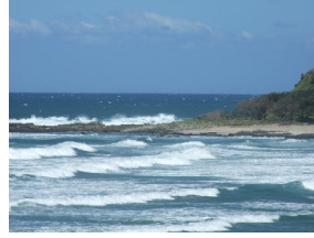
South African waves