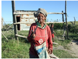
Native African woman