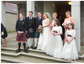
The Wedding Party