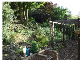
Garden finally maturing (after 18 years!)