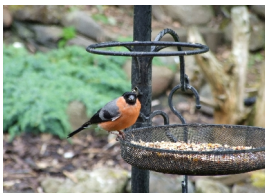
Our garden Bullfinch