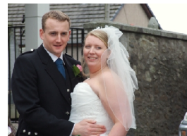
The Happy couple (again!)