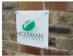
Andrew got a new logo and also moved premises in 2008