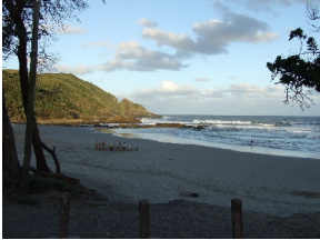
South Africa costal view