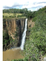
Howick falls, Natal