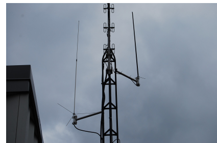
2mtr 70cm and 23cm antennas