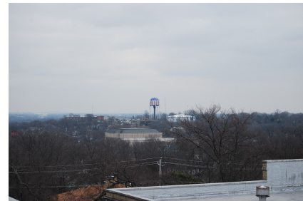
Possible ATV Tower Cam views