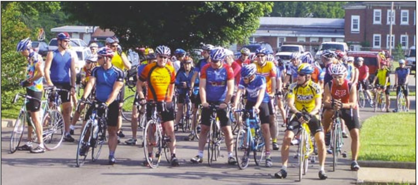
Early in the morning at the start line...