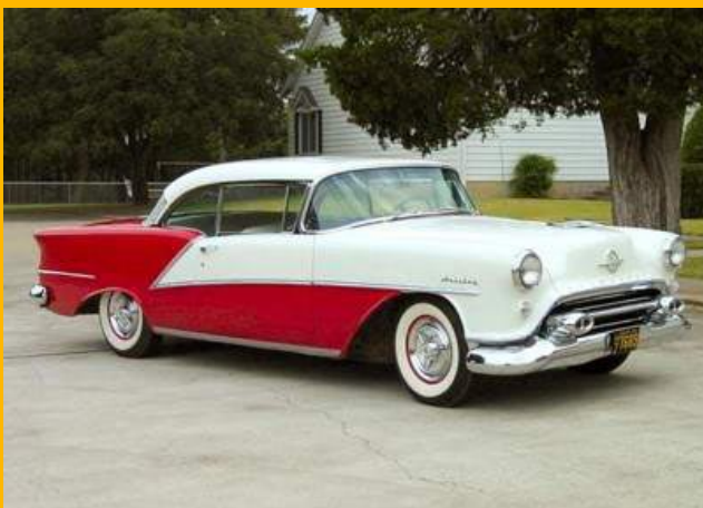
'54 Oldsmobile 98 Holiday