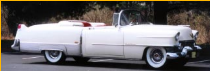
'54 Cadillac Eldorado Convertible Coupe

This 1954 IBM looks more like what? A couple of Sub Zero refrigerators and a washer/dryer combo?