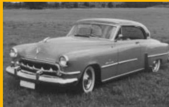
'54 Chrysler Imperial Coupe