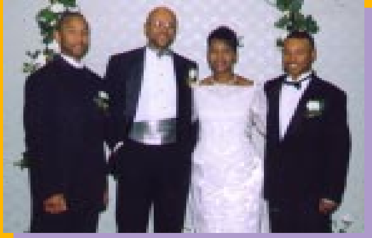
Emmett Ladd Scott Air Force Base, IL

Activities: I'm a high school sports official - basketball, volleyball, and soccer. I'm also a youth Bible study instructor. I enjoy traveling and meeting people, and outdoor activities. Other hobbies include stamp and coin collecting, and investing.