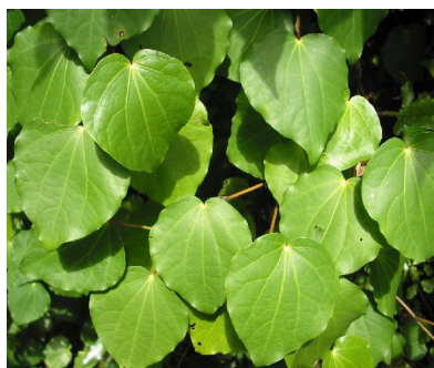
The Kawakawa (Scientific name Macropiper Excelsum ) is a traditional Rongoa Māori and is used to treat a wide range of illnesses.

The Clinic will be closed on public holidays and for one week of each school break