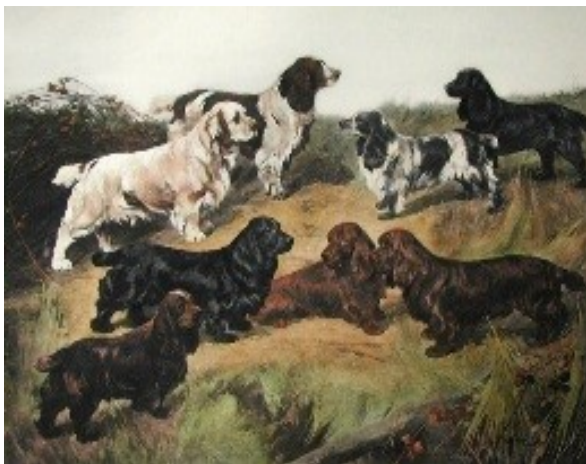
The land, or “field,” spaniels, 1911. Hand tinted Arthur Wardle lithograph from the author's collection.

Travel – whether over land or over water – was difficult and time consuming. Therefore, varieties within breeds developed regionally. The land spaniel on your English estate could look quite different from the land spaniel on my English estate. For example, spaniels developed on the estate of the Duke of Norfolk were known as “Norfolk Spaniels.” Spaniels from Sussex were known as “Sussex Spaniels.” Spaniels from the estate of the Earl of Clumber were known as Clumber Spaniels. “Springer” and “cocker” were terms that described the hunting functions of each. “Field spaniel” was a generic term that described them all.