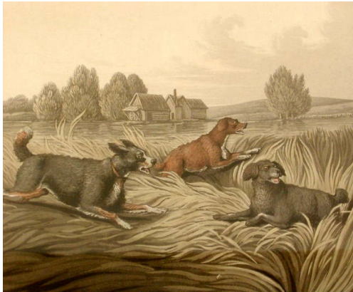
WATER SPANIELS IN THE LATE 1800's, NORTHERN EUROPE