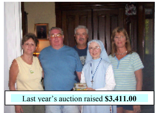
Last year's auction raised $3,411.00