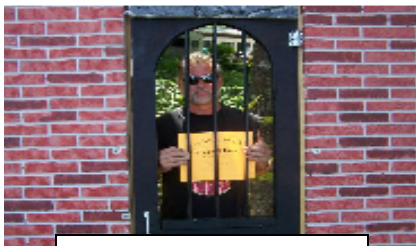
Family Day July 5 th