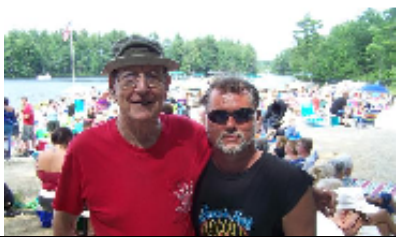
Family Day July 5 th