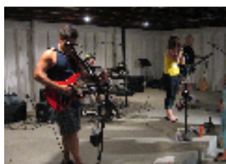
The Rock Daddys