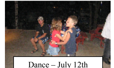
Dance – July 12 th