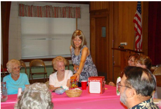
I need this more than you do.