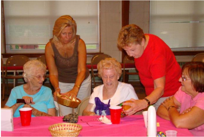
This is great for your sweet tooth.

The first regular meeting of the season was given over to an evening of barbecue, “catching up” after the summer, and an enjoyable game of gift-swapping. That is one of the few activities in which “Thou shalt not steal” is legitimately suspended!