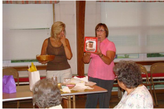
It's just what I always wanted!