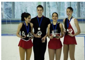
The Spirit Award and Banner Award were won by Lawrence High School