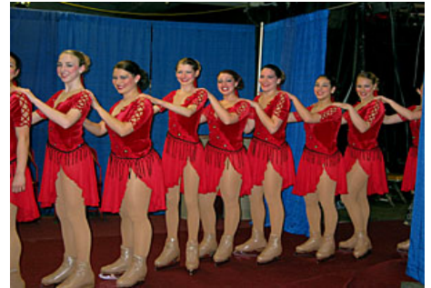
Ice Storm skaters wait backstage at Nationals.

If someone said you could get to Nationals without a double-axel or a triple jump, you would say that they're dreaming, right? Well, your dreams could come true! Synchronized skating is taking New Jersey by Ice Storm!