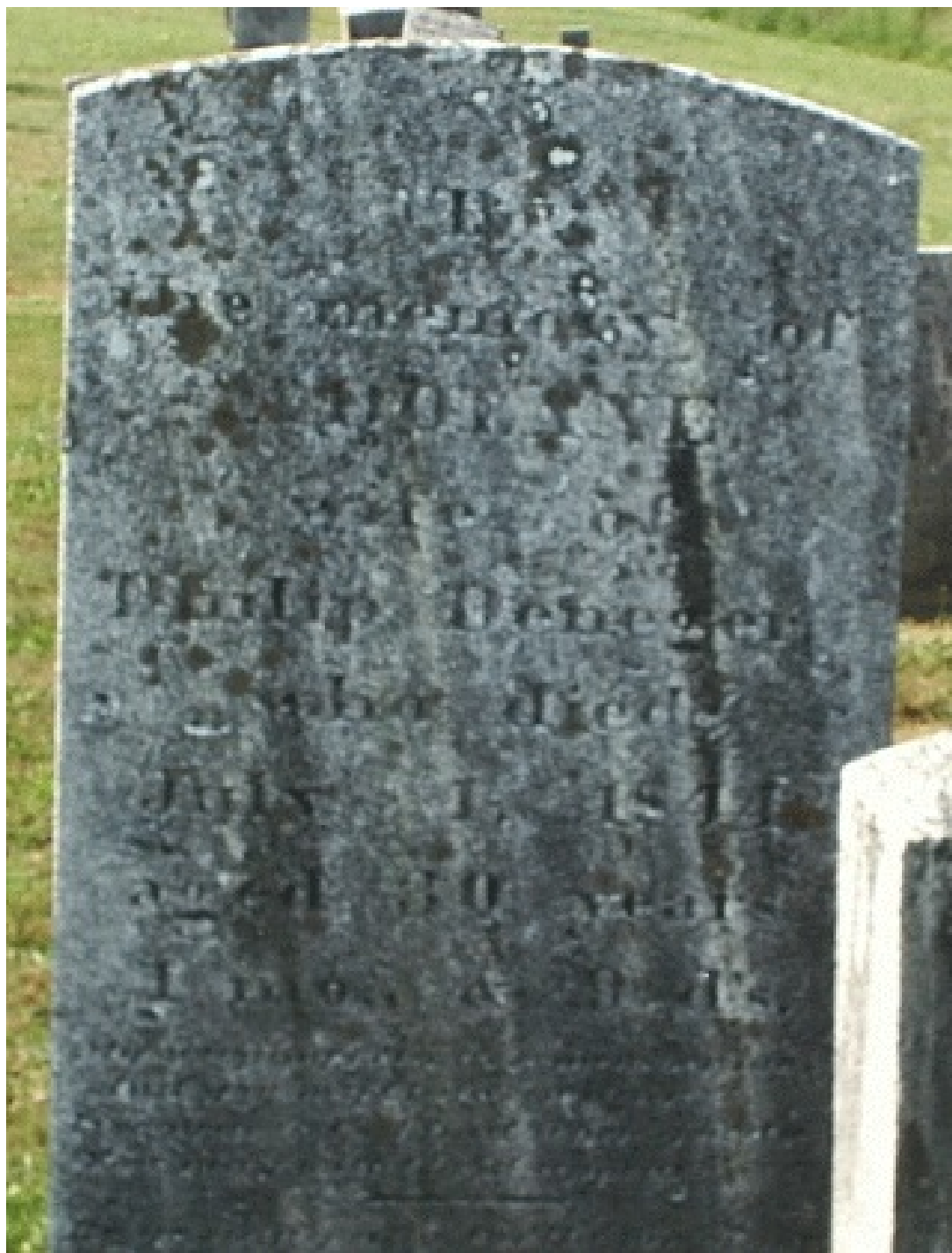
The grave of Adeline (Lasher) Denegar in the cemetery of Christ Lutheran Church