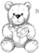
Bereavement Support Group