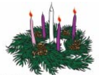
Third Sunday of Advent

This week we are happy for the Lord is near. In anticipation of the joy of Christmas, we light three candles on our Advent Wreath, recalling that joy is one of the surest signs of God's presence among us. Let us pray, Lord Jesus, may we share our anticipation of Christmas Joy with others in our family and in our community in good deeds and sharing. We ask this through Christ, our Lord. Amen