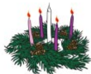
Fourth Sunday of Advent

We thank God for the gift of your life. We thank you for sharing it with us.