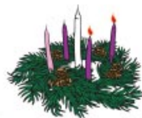
Second Sunday of Advent

We thank God for the gift of your life. We thank you for sharing it with us.