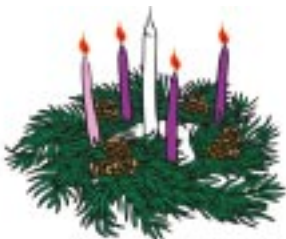
Fourth Sunday of Advent

Dear friends in Christ, on this Fourth and final Sunday of Advent, we recall the fullness of time, when the Son of God became human, conceived by the power of the Holy Spirit and born of the Virgin Mary. We remember Joseph's trust and faith in God, taking Mary into his home. We remember Mary's joyful acceptance of God's plan. In her "yes" to God, the Word became flesh and made his dwelling among us. Amen