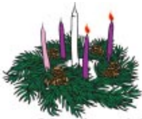
Second Sunday of Advent

This week this candle reminds us of John the Baptist. John calls us out to the desert, proclaiming a time of prayer and penance in the midst of the world's hectic holiday frenzy. Light the first and second candles of the wreath. Let us pray, Lord Jesus, may we open a way for you to come into our hearts and into our lives during the Advent Season. Keep us aware of the things that matter and of your love in coming to us. We ask this through Christ, our Lord. Amen