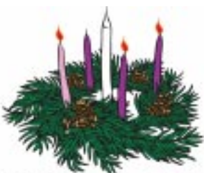
Third Sunday of Advent

As we light these candles in honor of N., We light them for our grief, our courage, our memories and for our love. This light is in your memory – the times we laughed, the times we cried, the times we were angry with each other. The silly things you did. The caring and joy you gave us. Nothing lost – but all enduring in Jesus's bright promise of new life.