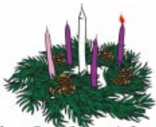
First Sunday of Advent