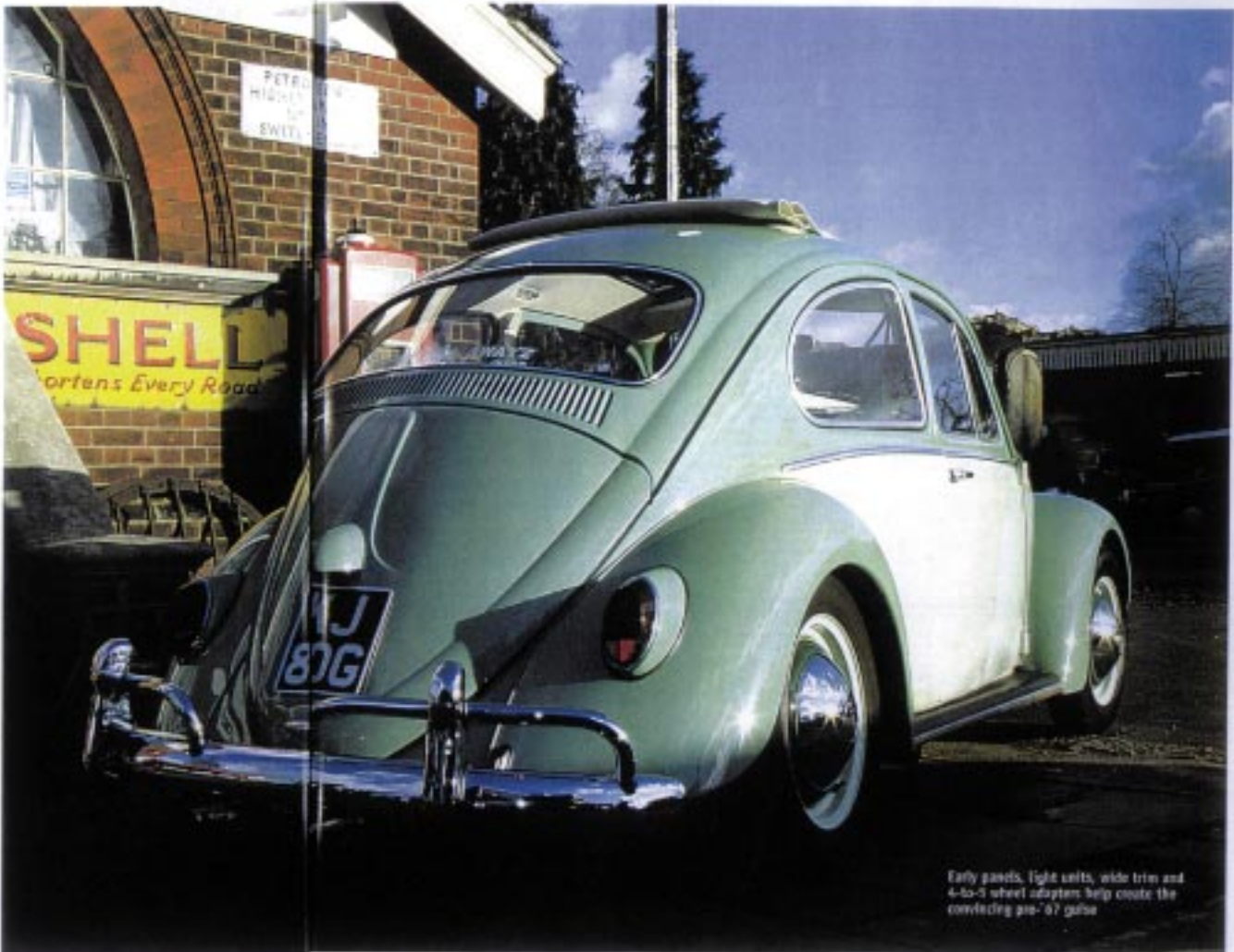
Early panels, light units, wide trim and 4-to-5 wheel adapters help create the convincing pre-'67 guise