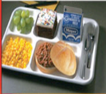
Reduced Fat Sloppy Joe