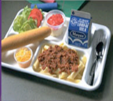
Reduced Fat Spaghetti Sauce