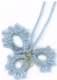
WINGS 1, 2 and 3