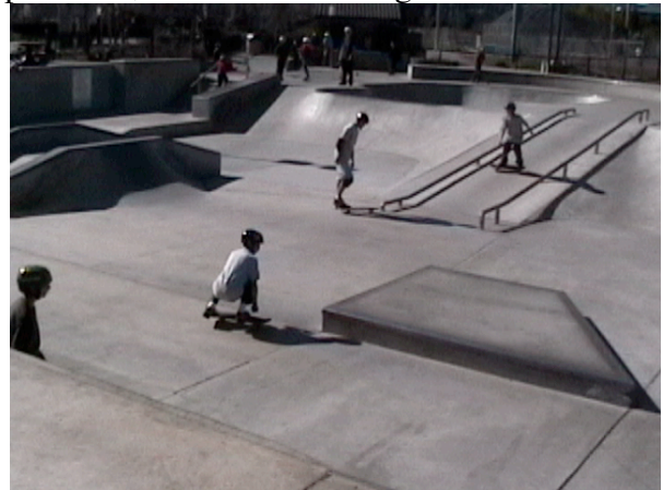
Here is two flat bars, the funbox, the manual pad, and the bowl in the background. The long flat bars can be fun just to slappy on, but if you want a challenge you can try to 5-0 it or something.

There is a vert quarter pipe, a few flat bars (no round), and a funbox. There is also a weirdly placed manual pad, a three stair with a kinked rail (what's the point?), and a six stair with two ledges and a rail. There can be some problems, but it's an overall good time.