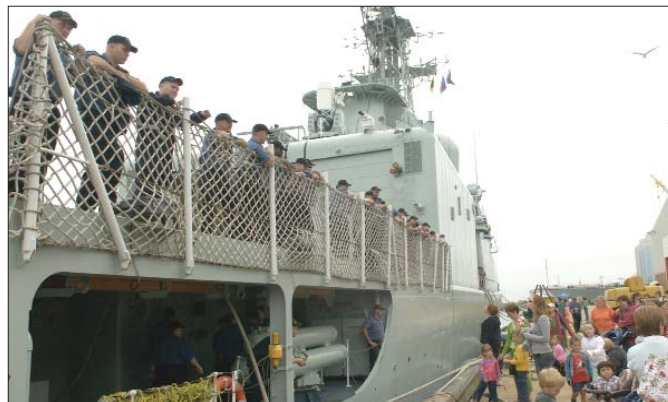
HALIFAX—HMCS Iroquois crewmembers exchange goodbyes with family and friends before sailing on a four-month round of exercises with NATO ships and ships of other allied countries.

As well, your parents are welcome to contact their local MFRC directly, or they can call the Mission Information Line, a national resource that provides support and mission-specific information to families and friends of deployed CF personnel.