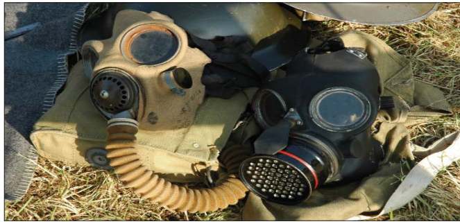
Second World War-era gas masks, Stirling, Stirlingshire, U.K.

Now, eligible veterans can receive the same payment if they served as test