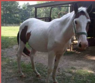
Sonoma Quarterhorse 4 year old mare

We have 2 additional horses available as well (no pictures available yet). Please call for more information if you or anyone you know is interested in adopting one of our precious horses.