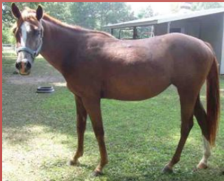
Tippy Quarterhorse 3 year old mare