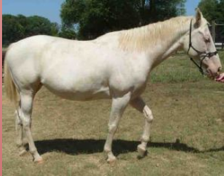
Applejacks Quarterhorse 10 year old mare