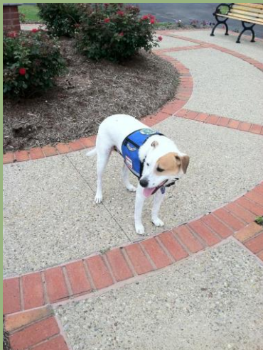
Otey dressed and ready for pet therapy

*Information from www.holisticonline.com*