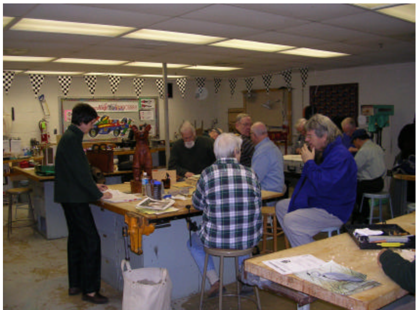
A few of our members and guests chatting and carving before the March meeting at GMJSHS Carving Center.