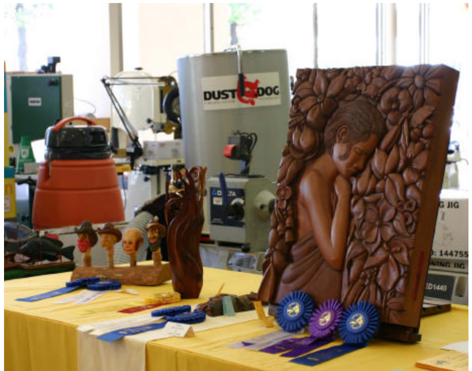
Above: Overall show winners. See Page 2 for detailed show results.

Show results are shown on Page 2. There were 106 entries for compe-