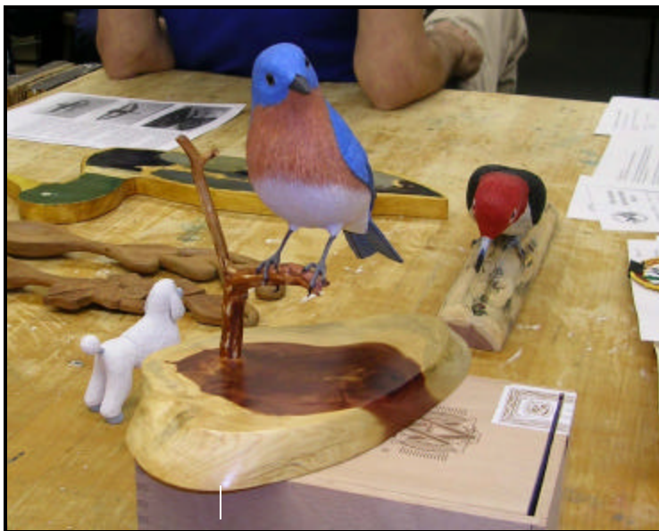
Show and tell carvings at July meeting. Foreground displays a very nice bluebird and poodle by Jim Loebach. The red-headed woodpecker and duck silhouette are by Pete Ward.

We encourage NVC members to participate, even if it is as a cheering section or a self interest activity, like taking a lesson for yourself, your children, grandchildren or friends. Better yet come and give a hand, even if only to help a child handle a file.