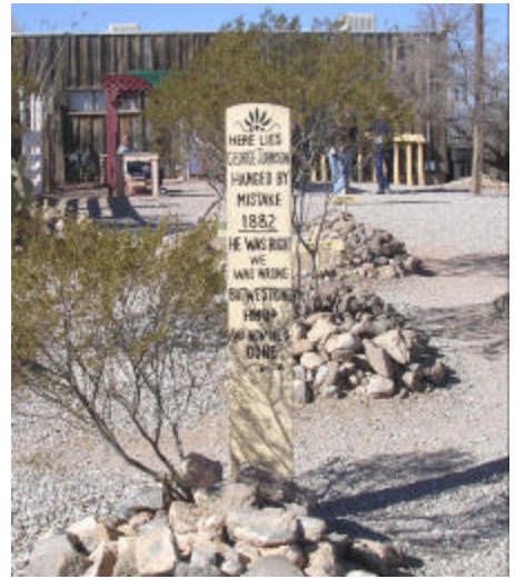
Right: Some sign carving circa 1882, Tombstone "Boot Hill"

Now I haven't been spending all my time napping. So far I've finished eight spirit Santas.