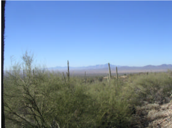
Left: Some of our scenery