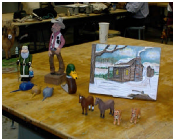
Show and tell carvings at November meeting.