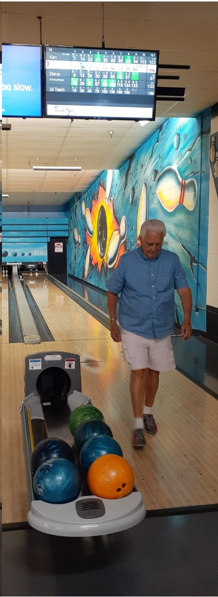
A few pictures from the 1st annual District #21 bowling tournament. It was a great day for fellowship and fun.