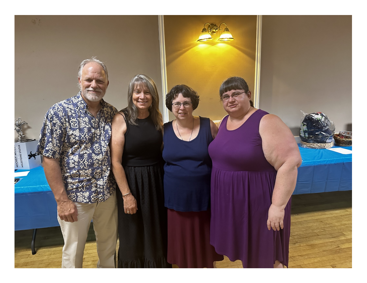
Wenatchee Court representation at Amaranth Scholarship Benefit.