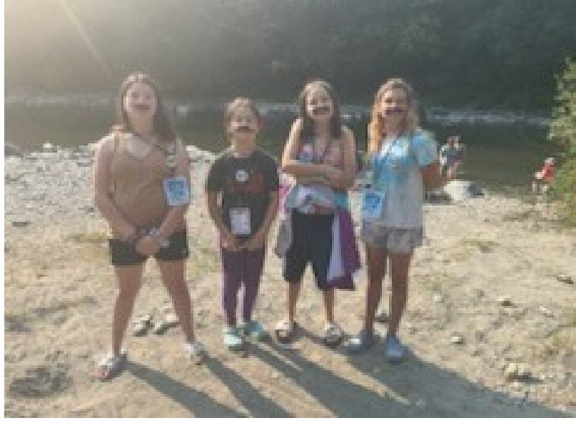
DREAM CAMP 2024