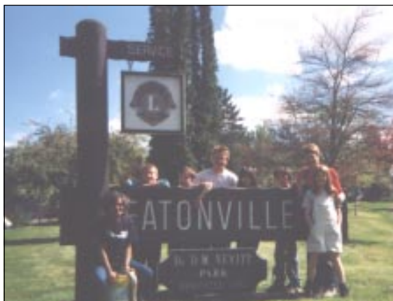
Jr. PSIA, Teens and Staff resting during the Town Beautification Project