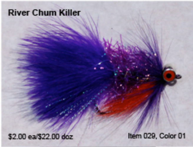
River Chum Killer