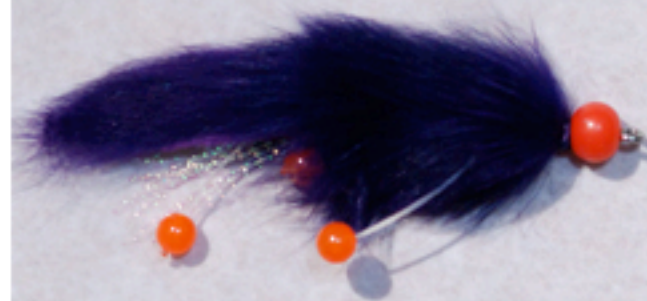
River Up-Chuck Leech