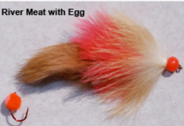
River Meat with Egg