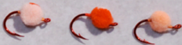
Glo Bugs (3 per pack)