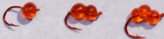
River Eggs (3 per pack)