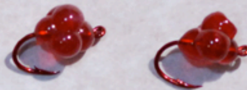
River Cluster (2 per pack)