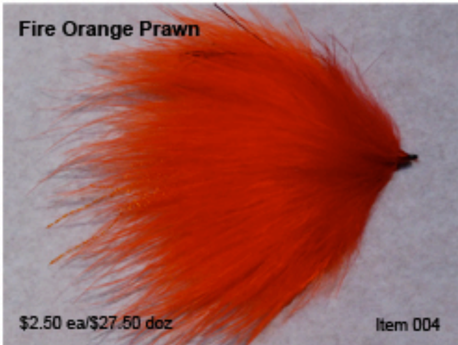
Fire Orange Prawn